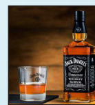
JACK DANIEL 1.700K