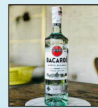
BACARDI LIGHT RUM 1.600K