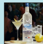
GREY GOOSE 1.700K

All basic include with mixer soft drink • Coca-cola, Sprite, Soda Water, Tonic Water