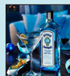
BOMBAY SAPHIER 1.450K