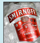
SMIRNOFF VODKA 1.300K